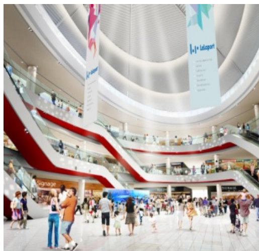
LaLaport EXPOCITY image (interior view)

Many other stores are due to open including for fashion, gift shops, services and restaurants in the food court.