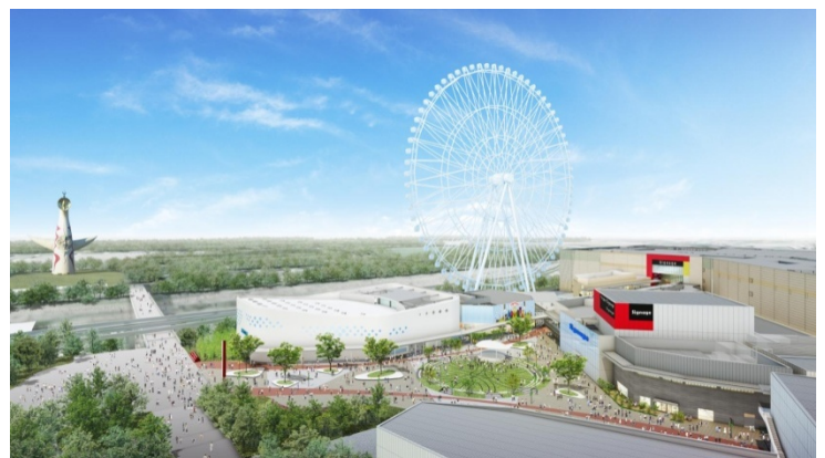
EXPOCITY (image) (exterior view)