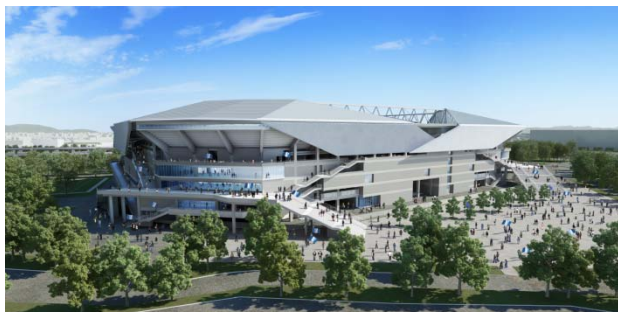
Suita Stadium (tentative name) (image) (exterior view)

Reference: Suita Stadium (tentative name) website (Japanese only) http://www.field-of-smile.jp/