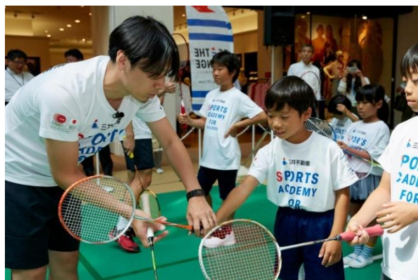
Second Mitsui Fudosan Sports Academy for Tokyo 2020 Badminton Academy