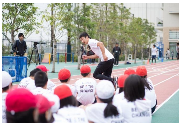
Fifth Mitsui Fudosan Sports Academy for Tokyo 2020 Athletics Academy