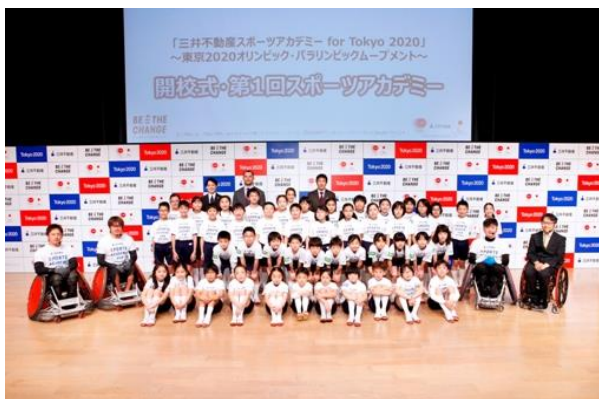
Opening of the academy