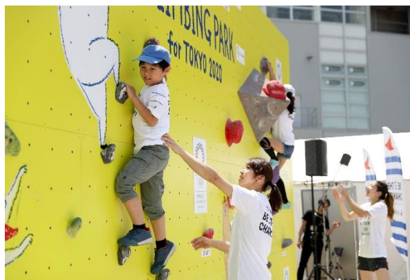
Seventh Mitsui Fudosan Sports Academy for Tokyo 2020 Climbing Academy