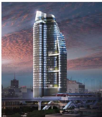
① Ideo Q Victory