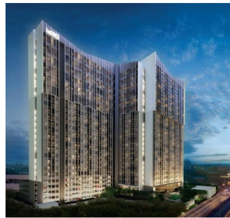
⑤ Ideo New Rama 9

Located in the Udomsuk district in the southeastern part of Bangkok, this is an area attracting strong attention due to its great potential because of The Bangkok Mall, a large-scale retail mall (under construction) as well as nearby developments such as the Bangkok International Trade and Exhibition Center. The property is a 10-minute walk from Udomsuk BTS Skytrain station, in a location featuring highly convenient living. Udomsuk Road, which links the station to the property site, is lined with a full range of facilities including a market, a community mall, and dining facilities.