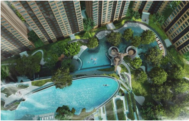
④ Elio Del Nest

Located in the Thong Lo district, a highly popular area among foreign visitors and residents, including Japanese people, the property is just a 6-minute walk from Thong Lo station on the BTS Skytrain. Thong Lo station and surrounding areas host a full range of retail, dining and other facilities. The property will provide residents with an excellent quality of living through well-appointed common facilities, including a sky pool and gym.