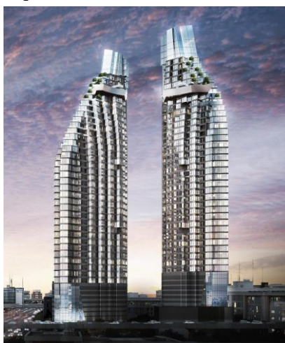
② Ashton Asoke-Rama 9