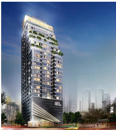
(6) Ideo Mobi Rangnam

The property is located in the Ramkhamhaeng district, which has long thrived as a residential area. It is a 10-minute walk from Ramkhamhaeng station on the Airport Rail Link, which provides direct access to Suvarnabhumi International Airport. The property offers highly convenient living with a 24-hour supermarket and a large-scale shopping mall within walking distance. Residents will enjoy an excellent living experience through attractive common facilities including a pool and gym.