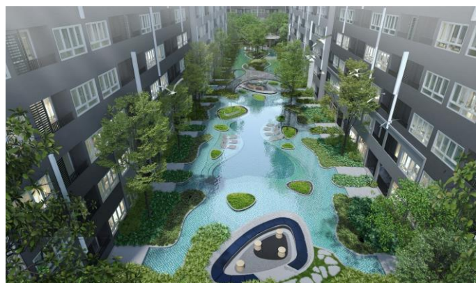
(7)Elio Del Moss