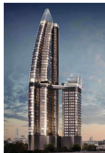
③ Ideo Q Sukhumvit 36