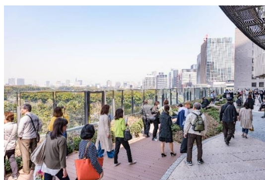
6th Floor: Park View Garden