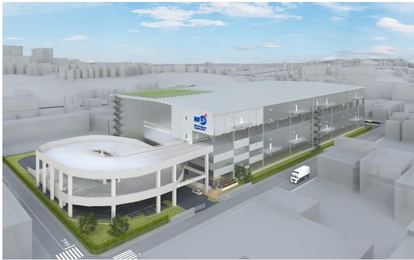
Perspective drawing of the exterior of Mitsui Fudosan Logistics Park Yokohama Kohoku

Located in the inland part of Yokohama, the facility will be close to three interchanges, including the Tomei Expressway, and also close to a highly populated area, which is rare for this type of site. Along with regional deliveries to the surrounding area, access is also good to central Tokyo.