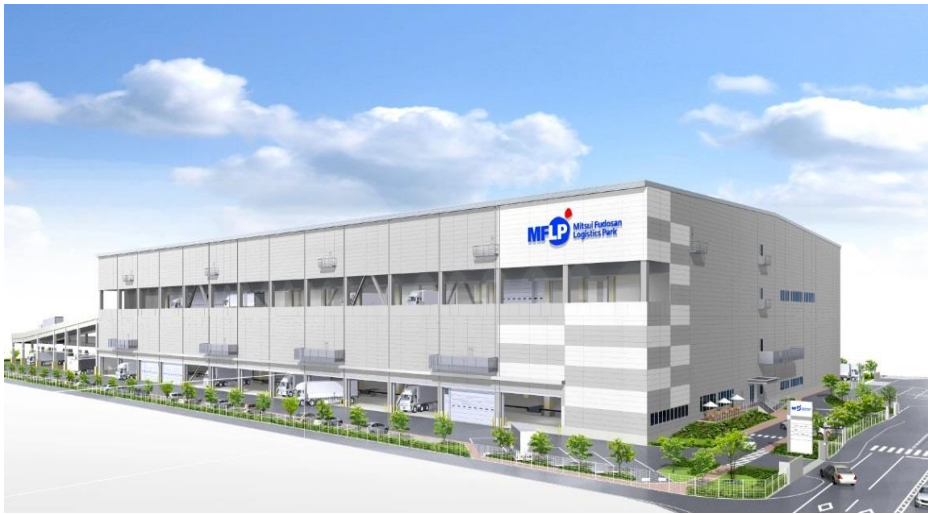
Perspective drawing of the exterior of Mitsui Fudosan Logistics Park Hiroshima I

The site is located in the downtown area of Hiroshima within approx. 3.7 miles (approx. 6 km) of the Hiroshima Bus Center where land is extremely scarce. It is close to both Yoshijima IC and Kanon IC on Hiroshima Expressway Route 3, and access is good from both interchanges. It has strong potential as a distribution hub to western Japan, connecting the Kyushu and Kansai areas.