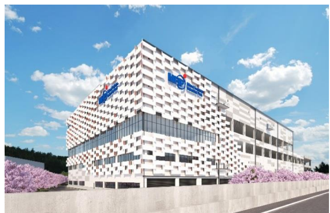
Perspective drawing of an exterior view of Mitsui Fudosan Industrial Park Haneda