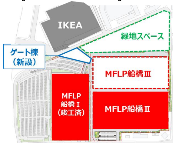
Layout of Mitsui Fudosan Logistics Park Funabashi

At the planned site for the facility, Mitsui Fudosan will strive for neighborhood creation for both living and working by establishing the Gate Building with a cafeteria, childcare center, storage services and other amenities alongside the new logistics facility. There will also be an expansive green space of approx. 215,000 ft 2 (approx. 20,000 m 2 ) that will be public and so open as well to people living in the Funabashi area. The plan is for the space to also serve as a temporary evacuation area during emergencies. MFLP Funabashi II, being built on the same site, is phase II of the Mitsui Fudosan Logistics Park Funabashi project. Construction got underway in February 2018 and is scheduled to be completed in October 2019. Construction on the adjacent Gate Building is slated to begin during fiscal 2018 and to be completed at the same time as MFLP Funabashi II. MFLP Funabashi III, announced today, is scheduled to begin construction in spring 2020 and to be completed in autumn 2021. This next-generation logistics park with a total site area of approx. 1,980,000 ft 2 (approx. 184,000 m 2 ) will contribute to further vitalization of the Funabashi area. The goal is for neighborhood creation that will get better and better with age.