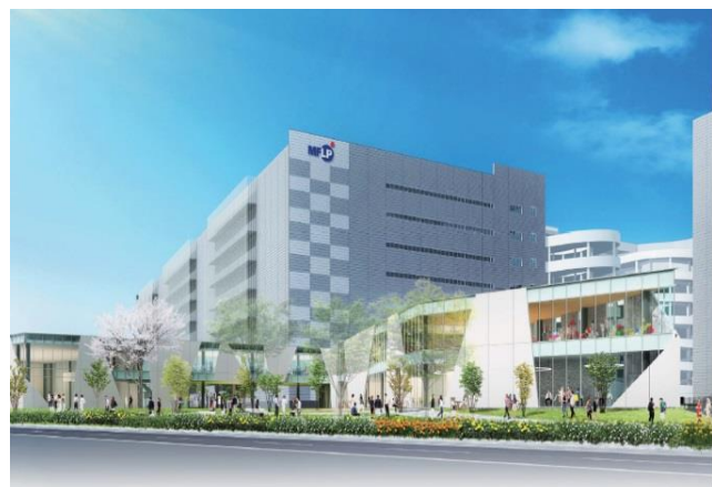
Perspective drawing of the exterior of Mitsui Fudosan Logistics Park Funabashi