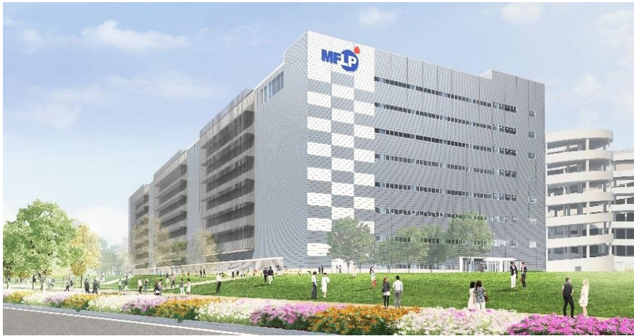
Perspective drawing of the exterior of Mitsui Fudosan Logistics Park Funabashi III

Mitsui Fudosan is planning to develop a phase III building for Mitsui Fudosan Logistics Park Funabashi, a neighborhood creation logistics base. The planned facility will be located within walking distance from JR Keiyo Line Minami-Funabashi Station and will have an expansive green space and cafeteria, among other features. The facility has extremely strong potential as a dispatch base covering the entire country, located approx. 20 minutes from central Tokyo and close to the Yatsu-funbabashi Interchange on the Higashi-kanto Expressway and the Hanawa Interchange on Keiyo Road.