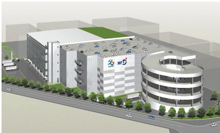
Perspective drawing of the exterior of Mitsui Fudosan Logistics Park Tachikawa Tachihi

The extremely rare site is within walking distance of Tachihi Station on the Tama Monorail and the population density is high in the neighboring area as well, so the potential for securing personnel is excellent. This project is being developed jointly with Tachihi Holdings Co., Ltd. and Tachihi Real Estate Co., Ltd.