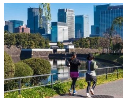
Jogging around the Imperial Palace

To give an example of possible activities, a comfortable morning jog or walk will give a feel for the greenery around the Imperial Palace. After returning to the hotel and freshening up with a shower, guests can take a walk to the TOKYO STATION GALLERY, Tokyo Station building or Tokyo Central Post Office. Guests can stretch their legs with a stroll along Marunouchi Naka Dori to the Ginza and Hibiya areas for shopping or a movie. This walking area is packed with dining spots, making deciding where to have lunch or dinner deliciously difficult. The location is almost like living in central Tokyo and allows guests to freely enjoy their stay in the capital.