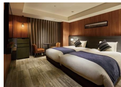
Guest room (Superior twin)