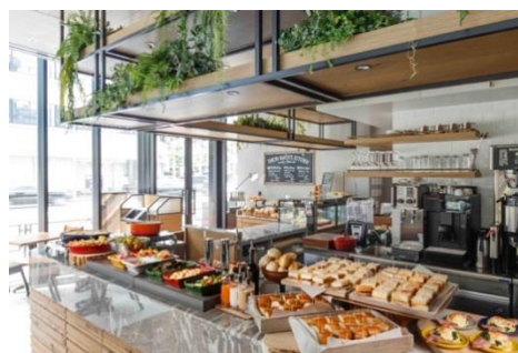
Bakery café and restaurant, “TOKYO BAKER’S KITCHEN”

For breakfast, a buffet is offered centered around sandwiches from all over the world made on homemade bread and meticulously selected delicatessen items. Special take-out boxes allow guests to enjoy breakfast their way in their favorite place, like their guest room or outside.