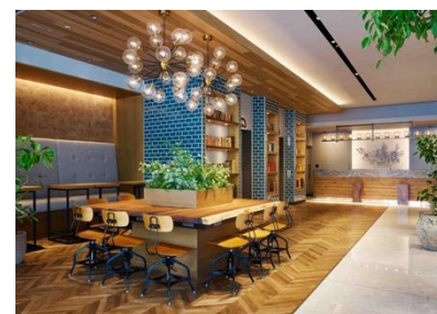
First-floor common area

Guests can leisurely pass the time in their own way in the guest rooms as well as the roomy relaxation space that is like a secondary living room.