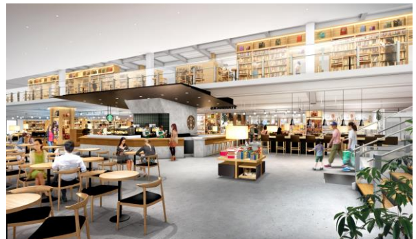
TSUTAYA BOOKS interior