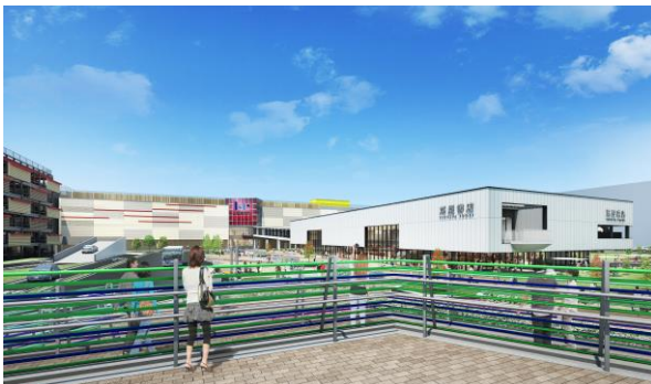
TSUTAYA BOOKS exterior

The store has childrearing proposals such as quality time spent with children, as well as food and living proposals to bring a luster to daily life. The store seeks to help everyone from young families to elderly couples to discover something to add a sparkle to their lives through its lifestyle proposals for enjoying together with family.