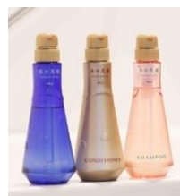
POLA Cosmetics amenities