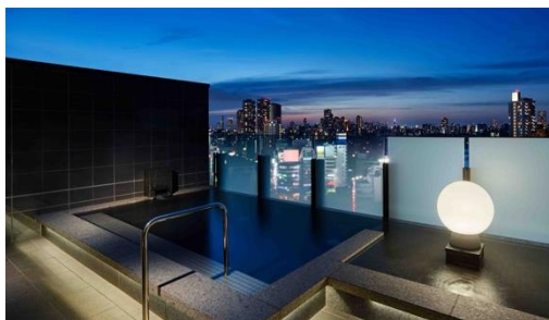
Panoramic outdoor spa (men's outdoor bath)