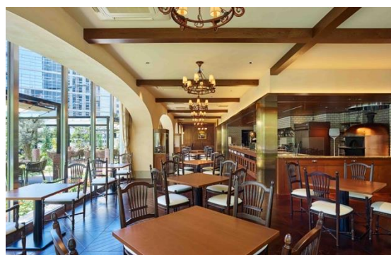
Tanto Tanto The Gardens restaurant

For lunch and dinner, meticulous attention has been paid to offer filling Italian dishes with a choice selection of ingredients, accompanied by a rich array of fine wines.