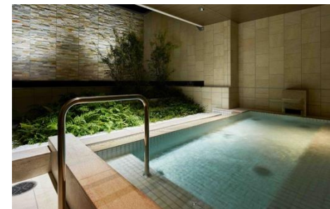
Large common bath (women’s outdoor bath)