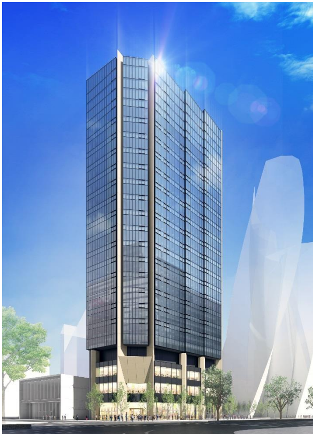
Exterior perspective image

An exclusive roof garden will be provided where office workers can relax. The garden aims to create a “third space” (a concept of space that is neither home nor office)--an open, airy working environment surrounded by greenery in the city center, which will help tenant companies’ working style reforms.