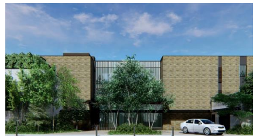
CG image of completed exterior of PARK WELLSTATE Hamadayama

The Group has started development of three properties in Tokyo and Chiba, and plans to accelerate development in major cities, mainly in Tokyo and three neighboring prefectures.