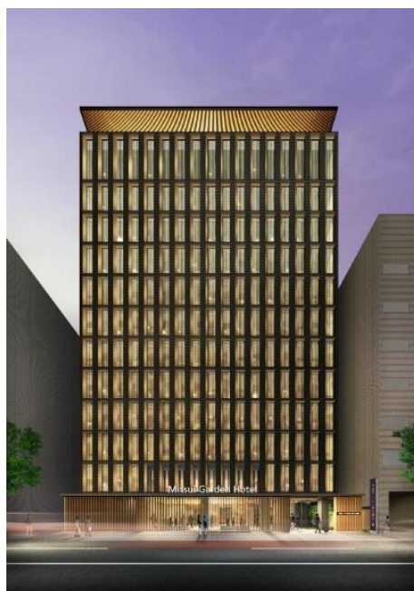
Mitsui Garden Hotel Kanazawa (Rendering)

Going forward, the Group will actively engage in new developments in major urban areas and regional cities designated by government ordinances. The Group will strive to provide services overflowing with hospitality while aiming to realize “hotels that satisfy the senses” and “hotels to remember” as an upper-grade accommodation-style hotel.