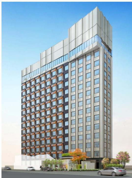
Perspective drawing of completed building * Building plan is subject to change. (Exterior design supervised by Jun Mitsui & Associates Inc. Architects)

Going forward, the Mitsui Fudosan Group will actively engage in new developments in the Tokyo metropolitan area and main regional cities throughout Japan.