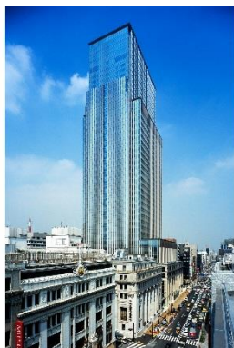
Nihonbashi Mitsui Tower (Chuo-ku, Tokyo)