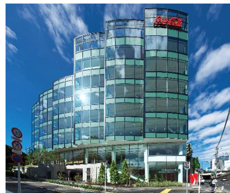
Coca-Cola (Japan) Company, Limited Headquarters Building (Shibuya-ku, Tokyo)

*Took part as Pelli Clarke Pelli Architects Japan, Inc.