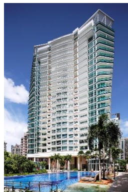
Nathan Suites (Singapore)