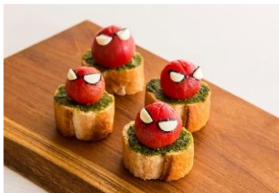
Capreze-Man (Pinchos) ¥500 (excluding tax)