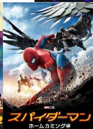
© 2017 Columbia Pictures Industries, Inc. and LSC Film Corporation. All Rights Reserved. | MARVEL and all related character names: © & ™ 2018 MARVEL.