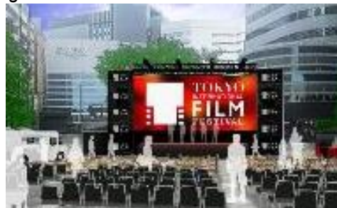
Image of an outdoor cinema at HIBIYA CINEMA FESTIVAL