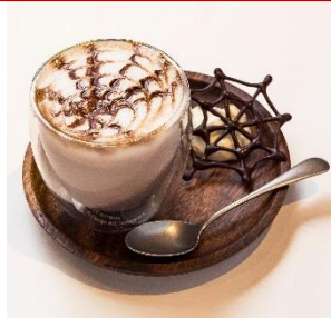
Spider chocolate ¥900 (excluding tax)

Cocktail expressed in the Spider Man colors of red and blue with cranberry juice and Blue Curacao, with a cute strawberry Spider Man on the cocktail stick.