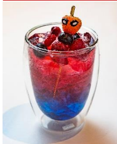
Spider Berry ¥1,000 (excluding tax)

Cocktail expressed in the Spider Man colors of red and blue with cranberry juice and Blue Curacao, with a cute strawberry Spider Man on the cocktail stick.