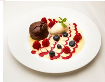
Spider Web Fondant Chocolate ¥1,280 (excluding tax)

Hot chocolate is poured over berry sauce. The spider web chocolate on the side has a crunchy texture.