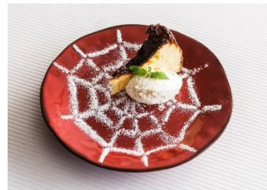
Web Cheesecake ¥700 (excluding tax)