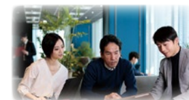
Multi-site shared offices for corporate clients