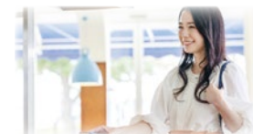
E-commerce mall linked to real stores