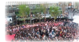
Creating neighborhoods full of life