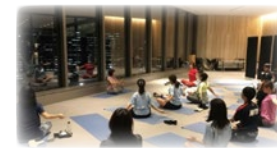
Support for diverse workstyles