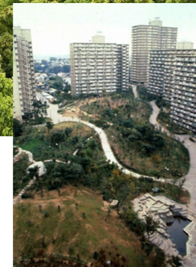
At the time of completion