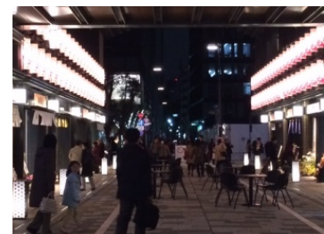
A scene from last year’s “ Nighttime Cherry Blossom Open Bar ”