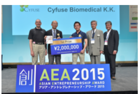
First prize winner Cyfuse Biomedical K.K. receiving award