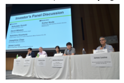
Investors panel discussion

An alumnus of AEA 2012 held a speech to the attendees, and premier investors brought innovative ideas to audiences through their panel discussions. In the afternoon, the AEA's judges selected 8 finalists among Asian 30 startups.