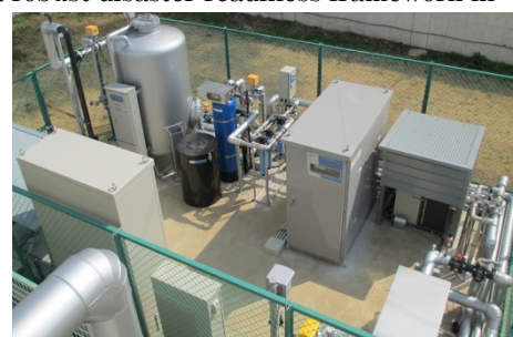
Utilization of well water

In the event of a disaster, we will keep people up to date on local conditions through on-site TV monitor broadcasts in collaboration with J:COM, a media outlet with close ties to the community. Further, LaLaport EBINA will be equipped with a well water filtration system, enabling treated well water to be used as drinking water during times of disaster. In addition, the facility will have an earthquake early warning system, and a strong communications system leveraging technology such as satellite mobile phones and MCA radios. There will be a robust disaster readiness framework in place for times of emergency.