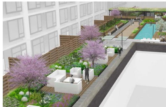
Perspective drawing of 2nd floor indoor garden