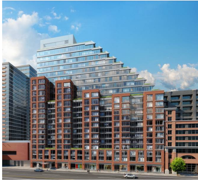
Perspective drawing of “525 West 52nd Street (tentative name)”