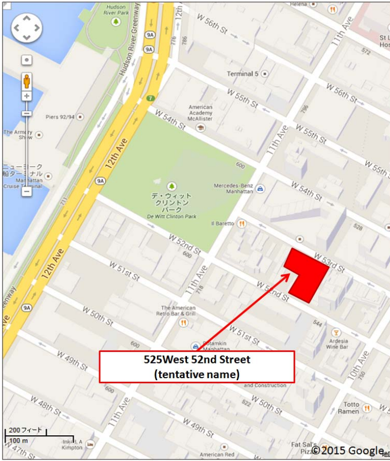
Close-up map *Inside of red frame in map of surrounding area