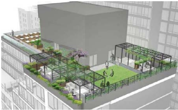
Perspective drawing of rooftop terrace (South Wing)