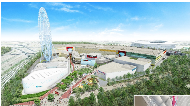
Bird's eye view of EXPOCITY