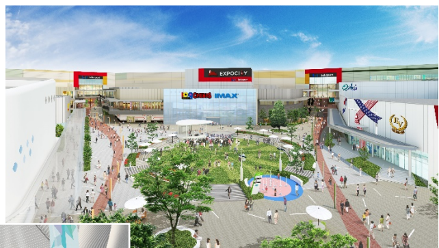
SORA Plaza is a large-scale outdoor plaza with a diameter exceeding 60 meters