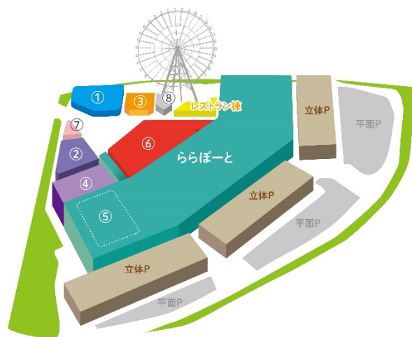
EXPOCITY Facility Map

The official shop and restaurant, REDHORSE MARUMIE PLAZA will start operating from November 19, 2015.