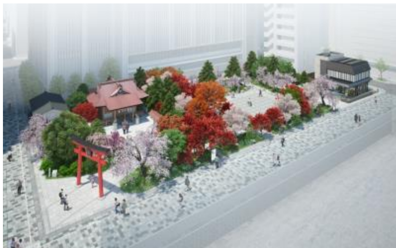
Overall image of Fukutoku Shrine and Fukutoku Garden

Now, Nihonbashi is bringing together a greater variety of people than ever before, and bustling with a new activity, as a result of such initiatives as the opening of COREDO Nihonbashi and COREDO Muromachi, and the Life Science Innovation project in which we are participating. At the center, Fukutoku Garden which will create a new regional community by the integration of the tangibles and intangibles, will become a symbol of the Nihonbashi Revitalization Program.