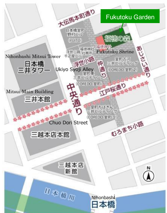
Right: Location of Fukutoku Forest