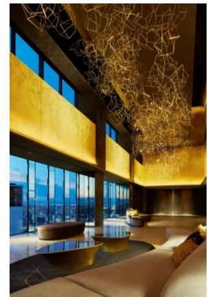
Lobby art "Golden Cloud"