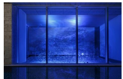
Spa art "Cloud"

The 18th floor is equipped with a spa exclusively for the use of guests' to relieve the tiredness of their journey. The courtyard has art installations with the motif of a sea of clouds, so mornings reflect the rising sun to create a space with a sense of coolness, while at nights a blue light is projected to create a dream-like space, enabling guests to enjoy the facility's different expressions depending on the time of day. In the women's spa, a light made in the image of a twinkling star has been installed in the powder room to convey a sense of cleanliness and elegance in which to relax at ease after getting out of the bath.