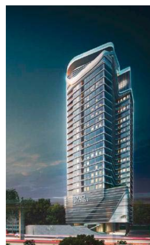
Ideo Mobi Sukhumvit 66