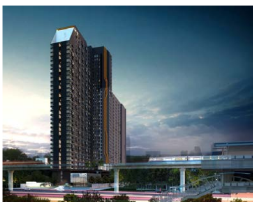
Ideo Sukhumvit 93