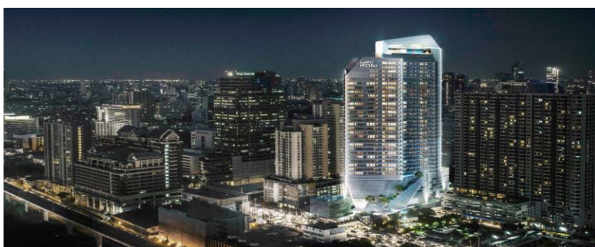
Ideo Mobi Asoke