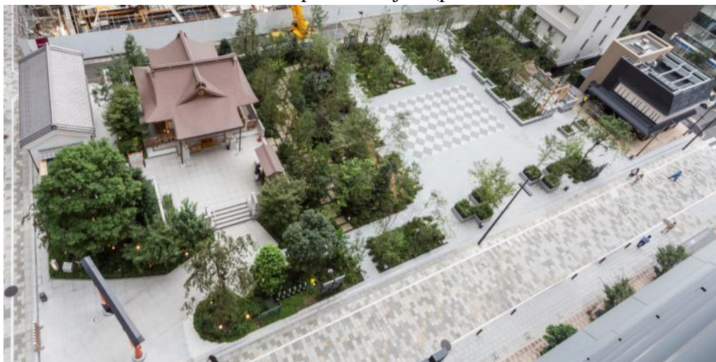
Fukutoku Shrine(part of the Nihonbashi Muromachi East District Development Project) Fukutoku Garden(part of the Nihonbashi-honcho 2-chome Redevelopment Project)