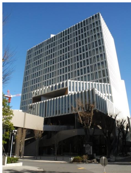
Building exterior seen inside the campus (west side)