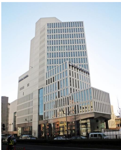
Building exterior seen from Kojimachi-odori (Shinjuku-dori avenue)

This is one initiative forming part of Mitsui Fudosan's efforts toward being a comprehensive solutions partner not limited only to real estate. Going forward, the Group will continue to move closer to incorporated educational institutions, help in campus and facility development to enhance each institution's brand while valuing the history of the institution and community, and strive to maximize effective use and revenue of owned assets.