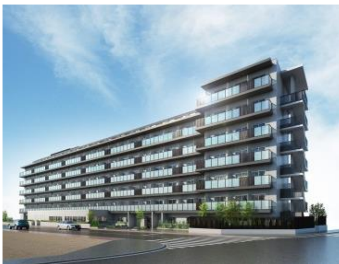
Computer-generated image of the exterior

*1 The "student dormitory business" refers to the housing business for students, covering student dormitories and student condominiums.