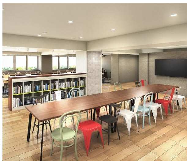
Computer-generated image of the shared dining hall