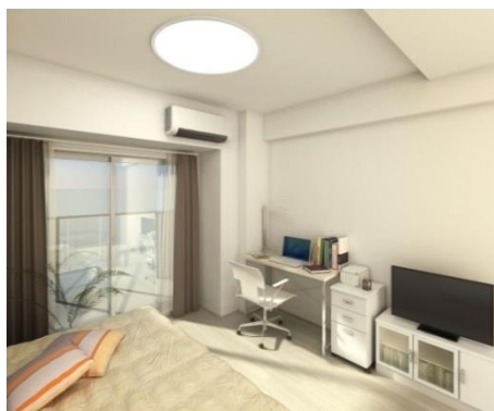
Computer-generated image of the private