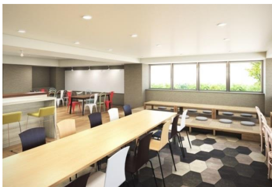
Computer-generated image of the shared dining hall

The dining hall seats 90, and the space design has been overseen by Mitsui Designtec Co., Ltd. of the Mitsui Fudosan Group. With other areas including a space with a raised tatami mat floor and a meeting space with a projector, the facility is designed to create spaces where residents can expand their sphere of communication with one another. The a nutritionally balanced menu designed by a nutritionist will be prepared in the dormitory kitchen, which will serve two meals in the morning and evening on weekdays.