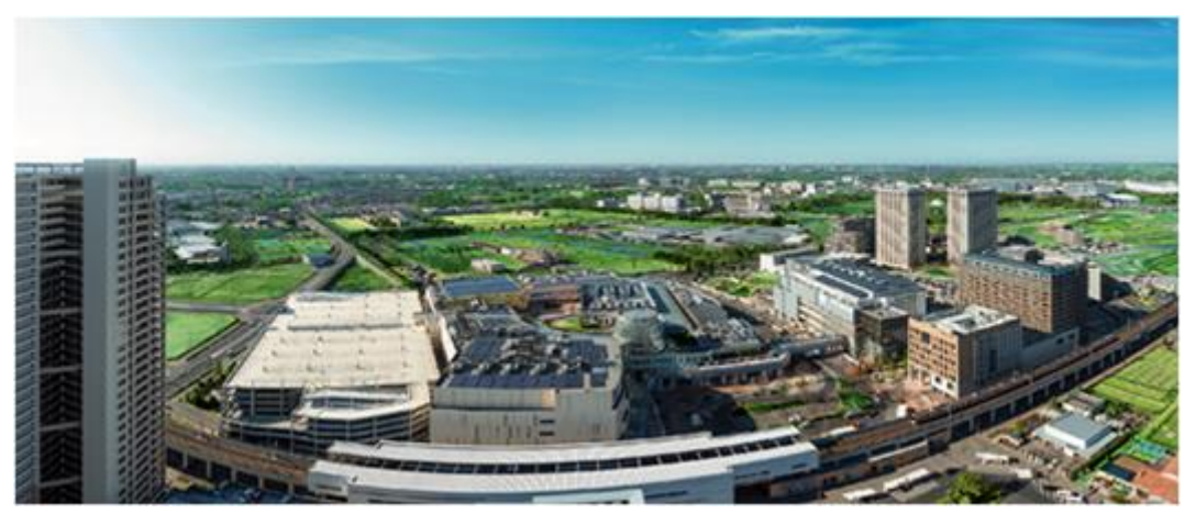
Full exterior view of Kashiwa-no-ha Smart City (Kashiwa-no-ha Campus Station and surroundings)

Mitsui Fudosan will continue these initiatives at Kashiwa-no-ha Smart City, aiming to realize an international academic city and an environmental city for the next generation.