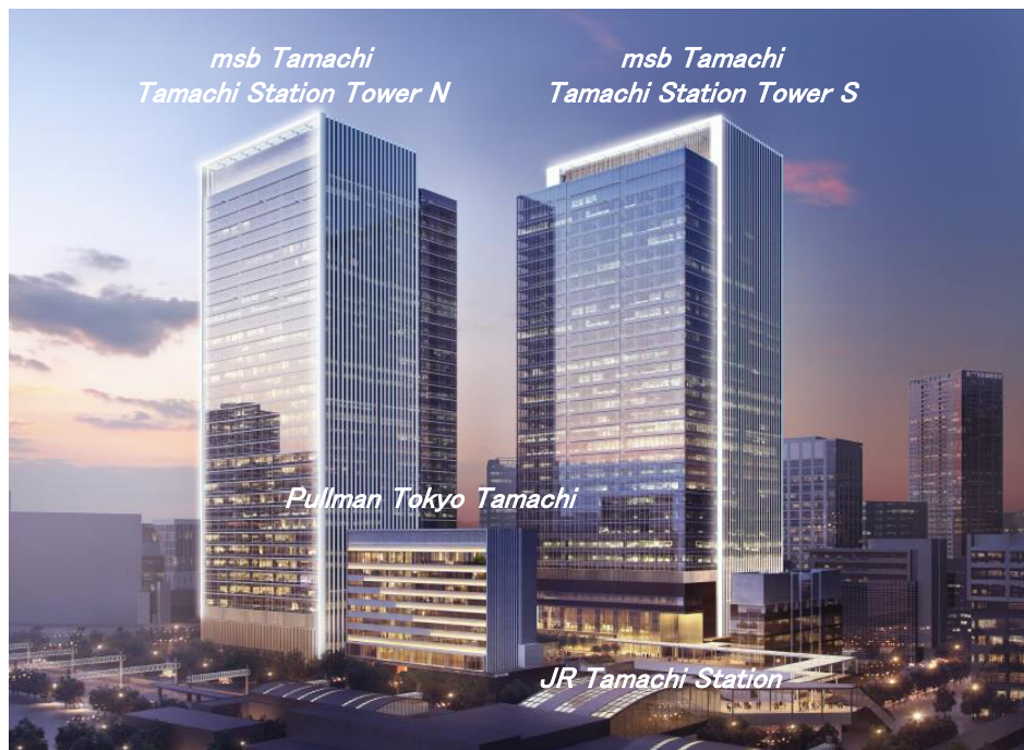
Perspective drawing of the exterior