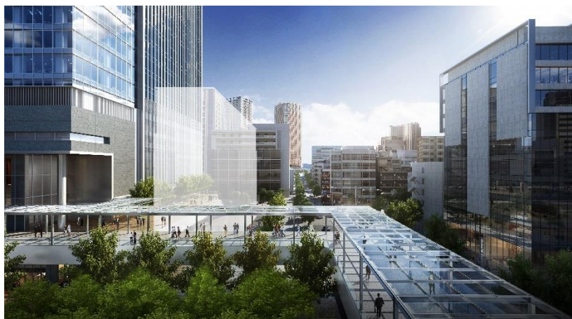
Perspective drawing of the roof deck seen from JR Tamachi Station