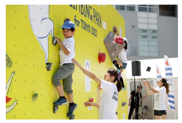
Seventh Mitsui Fudosan Sports Academy for Tokyo 2020 Climbing Academy