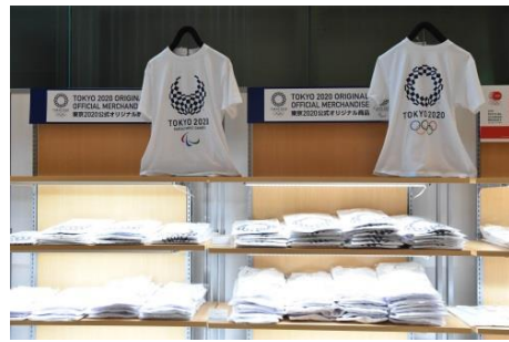
Scenes from the event in the previous fiscal year (Tokyo 2020 Official Licensed Merchandise Sales Corner)