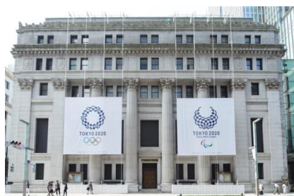
Wall decorations along the Mitsui Main Building on Chuo Dori Street

During the event period, the Tokyo Organising Committee of the Olympic and Paralympic Games will open and operate a Tokyo 2020 Official Licensed Merchandise Sales Corner for a limited period on the first floor of Nihonbashi Mitsui Tower.