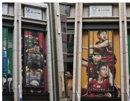
Scenes from the event in the previous fiscal year (Wall decorations along COREDO Muromachi 1 and COREDO Muromachi 3 on Chuo Dori Street)