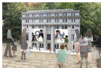
Nihonbashi City Dressing Photo Set