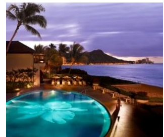
Swimming pool adorned with a mosaic of a Cattleya orchid (Halekulani Waikiki)

The site will cover an area of approximately 13 hectares. Taking full advantage of a beachfront site extending along a north-south direction, all 360 guest rooms will have ocean views. Hotel guests will be able to enjoy a diverse array of facilities, such as a swimming pool adorned with Halekulani’s signature mosaic of a Cattleya orchid, a spa offering wellness programs using natural hot springs, and four restaurants and bars featuring unique world-class dining experiences.