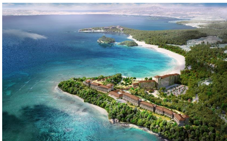
Bird's eye perspective rendering of the completed hotel