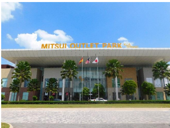
Exterior view of MITSUI OUTLET PARK KLIA SEPANG