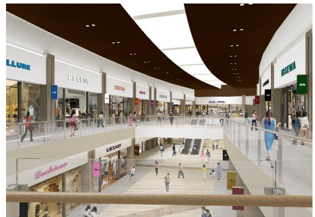
Perspective drawing of Phase 2 (River Walk)