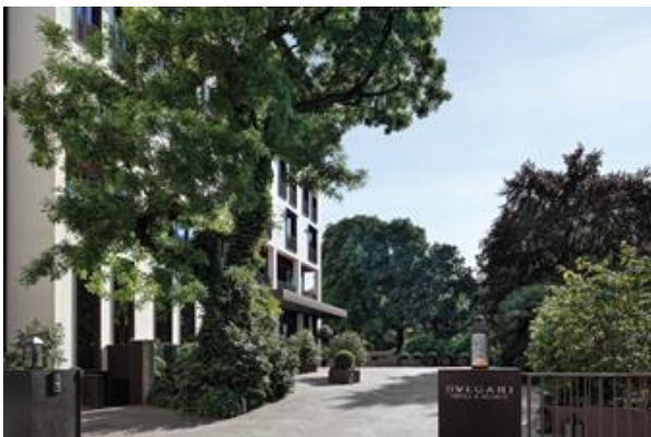
Bvlgari Hotel Milano

Having grown from a collection of three iconic Hotels & Resorts in Milan, London and Bali, Bvlgari Hotels & Resorts has recently be enriched by the Beijing and the Dubai properties . Four new Bvlgari Hotels are due to open from 2018 to 2022 in Shanghai, Moscow, Paris and Tokyo.