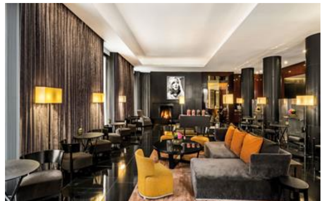
Bvlgari Hotel London