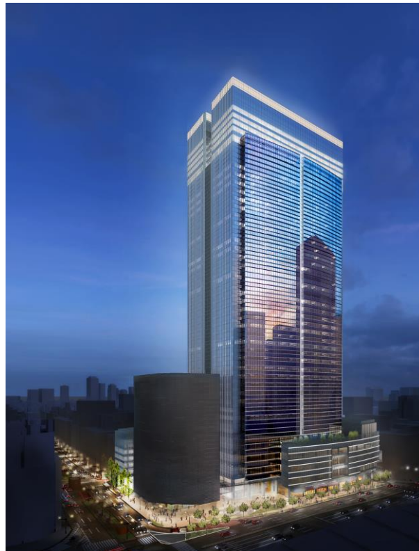
Render of The Bvlgari Hotel Tokyo ※1

Tokyo, Japan, 23 th April 2018 - Mitsui Fudosan Co., Ltd., a leading global real-estate company headquartered in Tokyo, signed an agreement with Bvlgari Hotels & Resorts to open Japan's first Bvlgari Hotel in the large-scale, mixed-use development planned for the Tokyo Station area. The Bvlgari Hotel Tokyo is scheduled to open at the end of 2022.