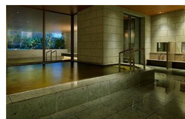
Mitsui Garden Hotel Kashiwa-no-ha