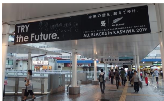
JR Kashiwa Station

Decorate Kashiwa City using main visuals.