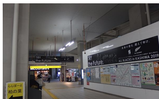
TSUKUBA EXPRESS Kashiwanoha-campus Station