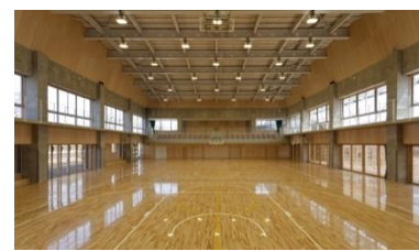
Kashiwanoha Elementary School Gymnasium