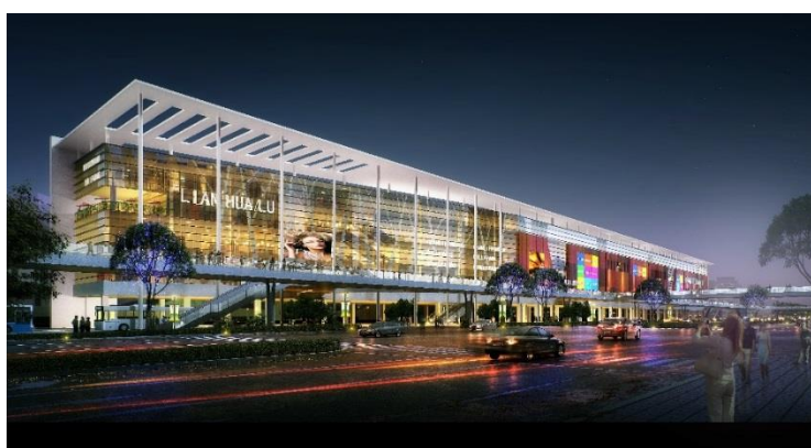
Perspective image of the completed Lianhua Road Station Building Retail Facilities (tentative name)

For commuters to the city center, students and local residents, the aim is to be a highly attractive retail facilities complex making new lifestyle proposals while being a close part of people's lives by providing them with convenience. In addition to bolstering restaurants, the plan is for a store composition that will introduce retailers with the capability to propose solutions and the ability to transmit information. Moreover, Mitsui Fudosan plans to utilize the experience it has with retail facilities in Asia to actively encourage Japanese tenants.