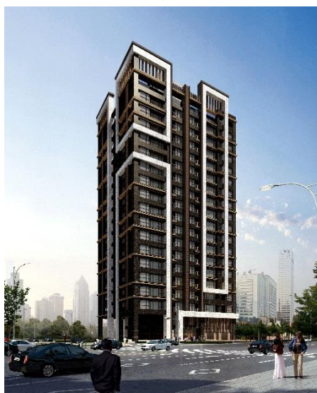
Perspective drawing of completed Sanchong Zhongxing Bridge Project (tentative name)

In addition to its close proximity to the city center and ample future potential, the site offers a living environment surrounded by greenery with the Tamsui River and Taipei Metropolitan Park only a short distance away. Moreover, the project plans to add originality and ingenuity unique to these industry-leading companies given their strong track record in Japan and overseas, including a Japanese-style color selection plan, periodic after-sales services, and the installation of Panasonic's smart condominium system.