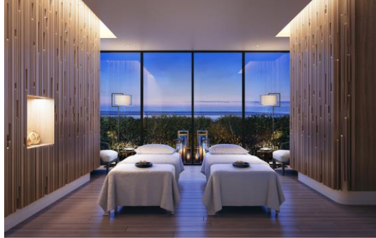
Spa treatment room

Halekulani Okinawa offers a stay experience on a whole new level of diversity and luxury provided by an impressive array of facilities. These include a beachfront of glistening white sand extending along a north-south direction, five different style indoor and outdoor swimming pools, including a pool adorned with around 1.5 million mosaic tiles in the shape of Halekulani's signature orchid and one of the most prestigious spa facilities in Japan with a bath fed by a natural hot spring.