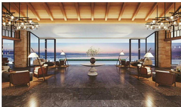
The lobby faces the sunset* 1

Halekulani Okinawa, the second Halekulani hotel, will make its appearance in Onna Village on the main island of Okinawa, which has some of Japan’s most beautiful beaches. The resort faces approximately 1 mile (1.7 km) of coastline, and features 360 rooms, each with a picturesque ocean view of a shining emerald sea and white sand beach. Situated in the Okinawa Kaigan Quasi-National Park, the abundant natural scenery of the resort can truly be described as a paradise. While the facility is a beach resort, it is set among lush Okinawan trees, and the eye is drawn into the glistening sea and greenery amid the sound of waves crashing on the beach. From the moment guests arrive at the resort, they are completely removed from everyday life able to the sparkling sea and the ocean’s roar as the setting sun sinks slowly beneath the waves on the horizon.