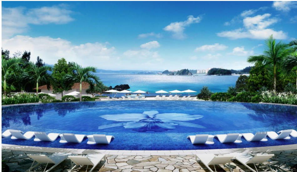
A pool with the signature orchid motif

Halekulani Okinawa will inherit the accumulated traditions and spirit of Halekulani, while making full use of the attractions of Okinawa, such as its abundant nature and culture, aiming to create a one-of-a-kind luxury resort. Mitsui Fudosan will provide spaces and hospitality that will make guests want to come back again and is eagerly anticipating the first guests.