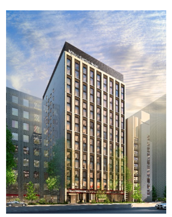
Exterior (completed perspective)