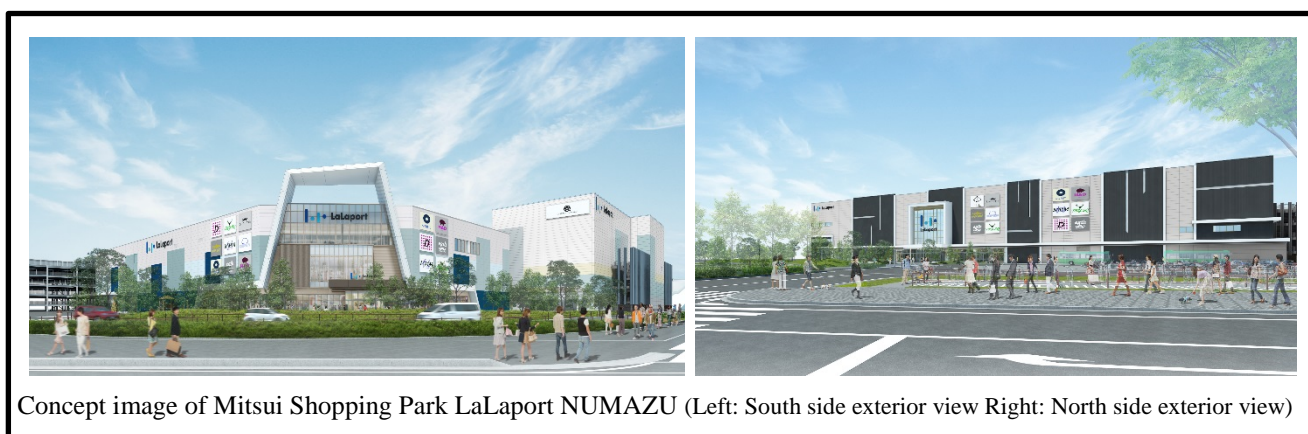
Concept image of Mitsui Shopping Park LaLaport NUMAZU (Left: South side exterior view Right: North side exterior view)

Details for other stores aside from those released in advance will be announced in June 2019.