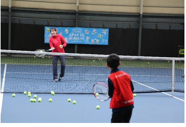
Fifteenth Mitsui Fudosan Sports Academy for Tokyo 2020: Tennis Academy