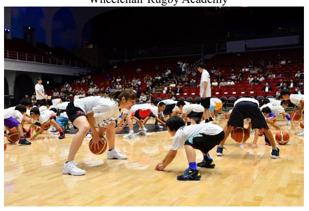
Tenth Mitsui Fudosan Sports Academy for Tokyo 2020: Basketball Academy