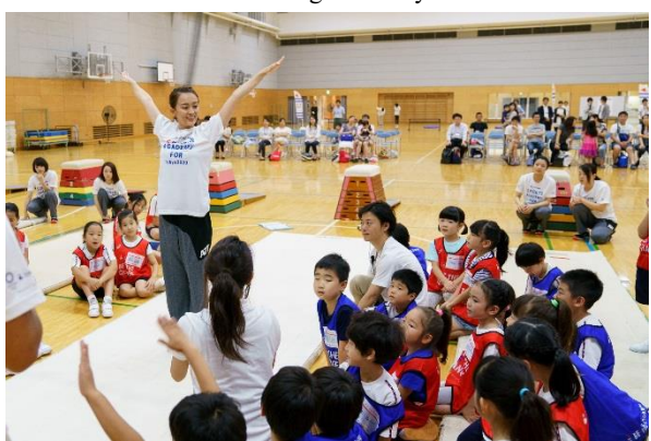
Ninth Mitsui Fudosan Sports Academy for Tokyo 2020: Gymnastics Academy