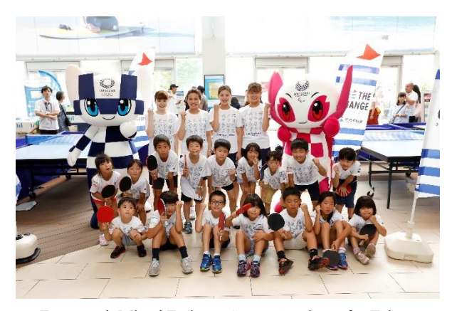
Fourteenth Mitsui Fudosan Sports Academy for Tokyo 2020: Table Tennis Academy