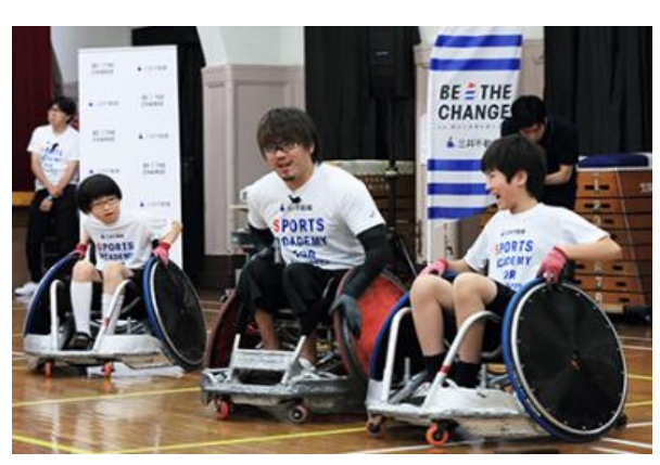
Eighth Mitsui Fudosan Sports Academy for Tokyo 2020: Wheelchair Rugby Academy