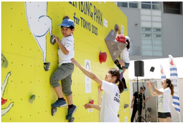
Seventh Mitsui Fudosan Sports Academy for Tokyo 2020: Climbing Academy