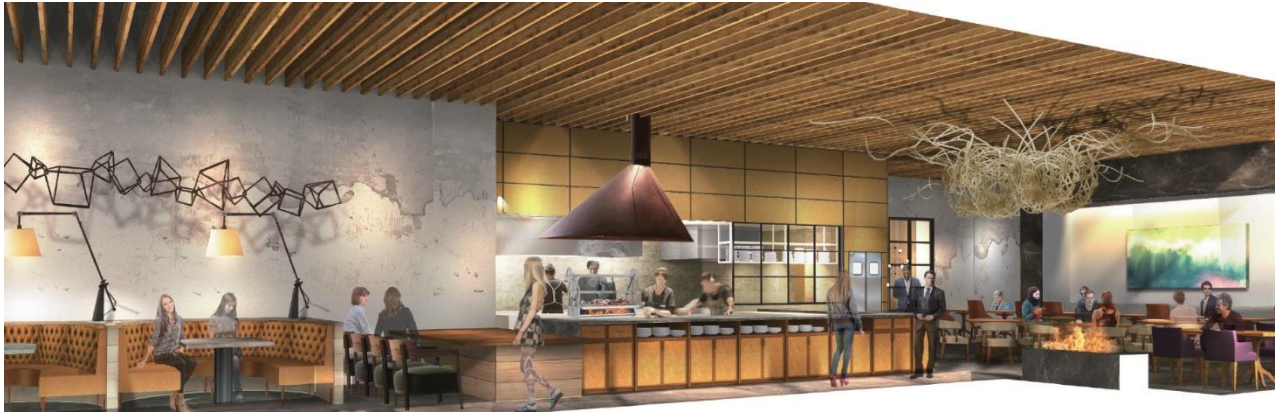
Inside the restaurant (an open kitchen with a firewood oven and seating area)