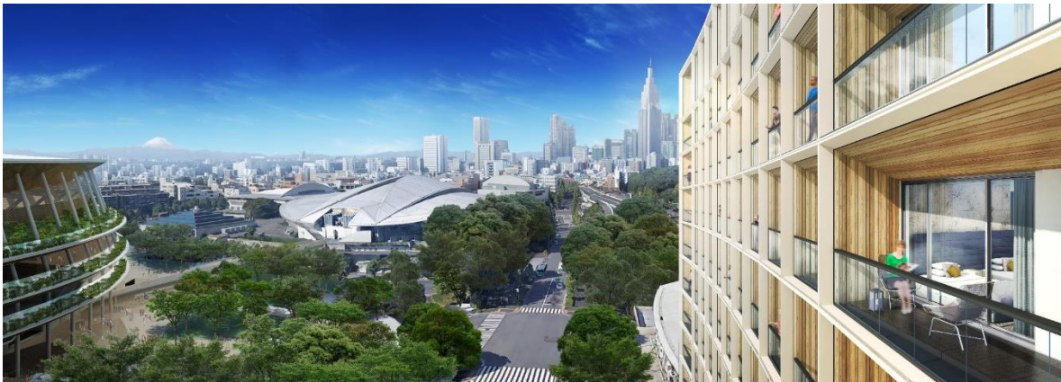
Guest rooms with balconies and views

Moreover, all guest rooms have a balcony to enjoy the cityscape, in addition to garden views of Meiji Jingu Gaien and the Shinjuku Gyoen National Garden.