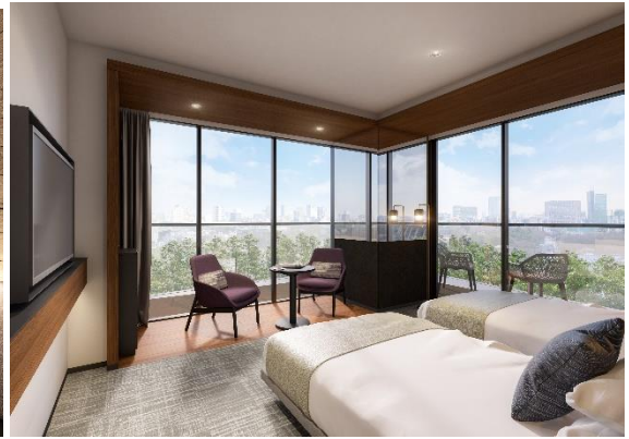
Premier twin (approx. 410 ft 2 (approx. 38 m 2 ))