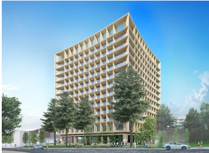
Exterior (completed perspective)