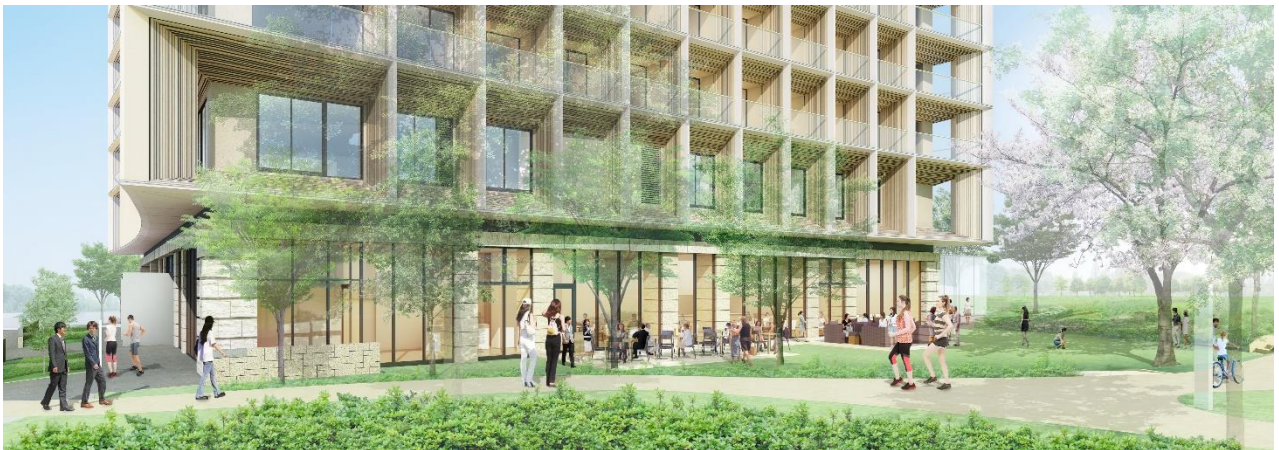
The restaurant as seen from the garden terrace on the hotel's eastern side

RISTORANTE E'VOLTA, operated by RY Corporation Inc., will open on the first floor where the lobby is located, and is a modern Italian restaurant that fuses all food concepts with the esprit of traditional Japanese stylishness while respecting Italian culinary culture and regionality. On the terrace side, large windows of approx. 13 ft (approx. 4 m) by approx. 115 ft (approx. 35 m) will be set up, enabling guests to view scenes of the rich greenery of Meiji Jingu Gaien through the windows while enjoying meals with an ambience of openness and sophistication.