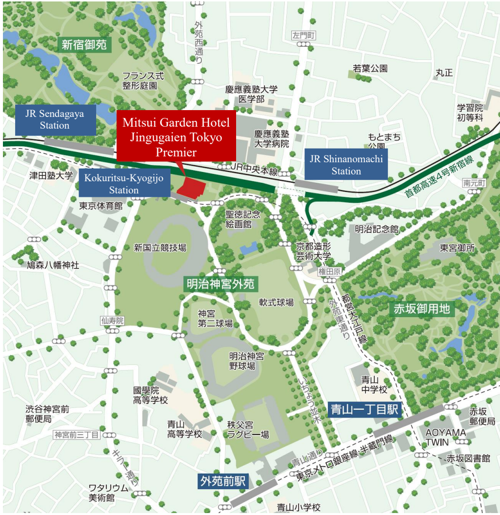
Map of Surrounding Area