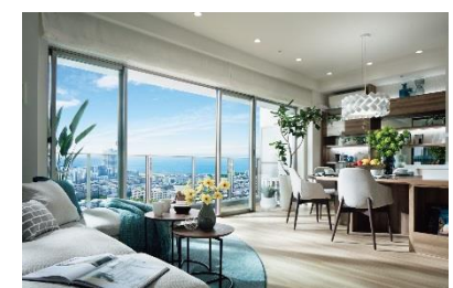
「Makuhari Bay Park Skygrand Tower showroom (2)