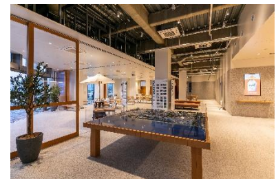
Photo of Makuhari Bay Park Crossport interior

“I plan to organize various events as a member of B-Pam while figuring out what sorts of communication we can facilitate in a new neighborhood through our coffee.”