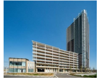
Photo of Makuhari Bay Park Cross Tower & Residence exterior

In March 2019, the buildings were completed and residents began to move in. With many making a new start in their lives, the neighborhood is becoming more lively.