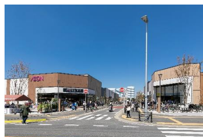
Exterior of Aeon Style Makuhari Bay Park