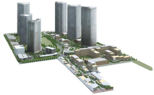
Perspective image of neighborhood based on the Master Plan*4

Makuhari Bay Park is a project to develop a neighborhood that will be home to approx. 10,000 residents*3 through the construction of 4,500 residential units*2 in eight zones covering a total area of 1,892,392ft2 (175,809 m2) over a period of more than 10 years*1. Modeled on Portland, Oregon in the U.S., the project design places the condominiums around Wakaba 3-chome Park (owned by Chiba City) and seeks to create a vibrant neighborhood with various mixed-use functions. The Design Guideline for neighborhood creation was supervised by Jun Mitsui, a world-class Japanese architect known for many highly acclaimed designs, who also undertook the exterior design of the Cross Tower & Residence and Skygrand Tower.