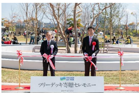
Ribbon-cutting ceremony outside the tree deck officiated by the Mayor of Chiba

* The event to mark the completion of the first stage of the project refers to the ceremony to celebrate the start of occupancy of Makuhari Bay Park Cross Tower & Residence (the first in the series of condominium residence projects) and the grand opening of facilities such as Aeon Style Makuhari Bay Park, Makuhari Bay Park Crossport, and TENT Makuhari. The entire Makuhari Bay Park residential development project spans over 10 years.