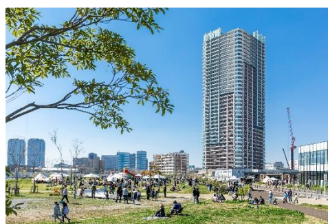
Social event at Wakaba 3-chome Park

A presentation on the Makuhari Bay Park neighborhood creation program, a ceremony to present the tree deck completed in Wakaba 3-chome Park to Chiba City municipal government, free tours of newly opened facilities Aeon Style Makuhari Bay Park, Makuhari Bay Park Crossport, and TENT Makuhari, and a social event organized by residents took place on April 13, 2019. It was a day to experience the excitement generated by activities unique to Makuhari Bay Park that engage the whole neighborhood centered on the park, mixed-use living that combines various facilities and functions, and a new style of area management with residents taking the initiative.