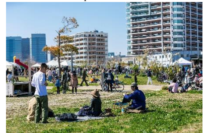
Scenes from Makuhari Bay Park Picnic