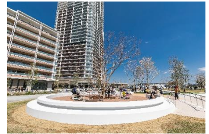
The completed Wakaba 3-chome

* Landscape Formation District: Specified district within a landscape planning area that requires pioneering landscape formation that makes the most of regional character. The Makuhari Wakaba District was designated a Landscape Formation District of Chiba City in the Chiba City Notice No. 3 issued January 4, 2019.