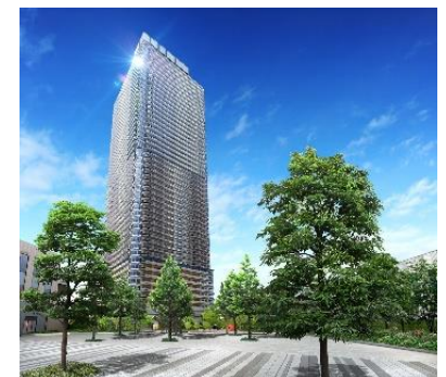
Conceptual image of Makuhari Bay Park Skygrand Tower*

Makuhari Bay Park Skygrand Tower is the second in the series of condominium residence projects. It is a base-isolated skyscraper 48 floors high above ground with 826 residential units. Aside from these units, the building will also house a clinic mall, a multigenerational sports facility with an arena that offers specialist training provided by athletes, and a sports bar and restaurant offering beauty- and health-conscious food and drink where local residents can socialize and watch sporting events. The first round of sales for this condominium have already begun.