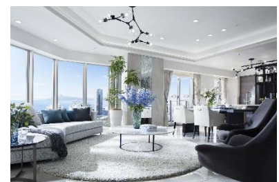
Makuhari Bay Park Skygrand Tower showroom (1)