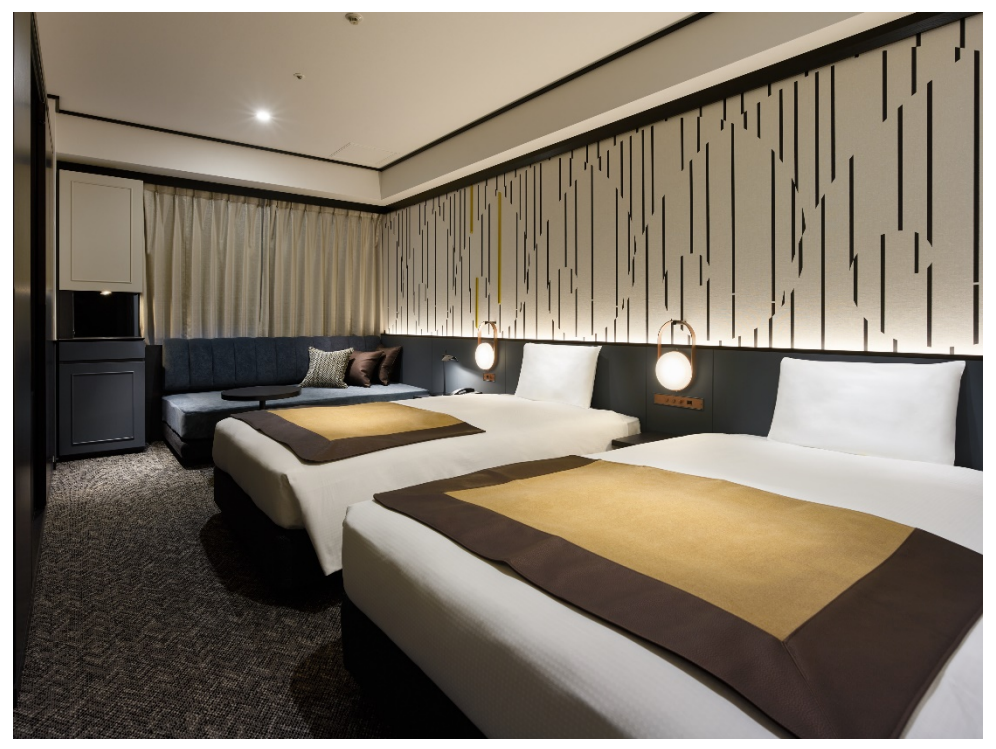
Superior Twin (for 3 guests)