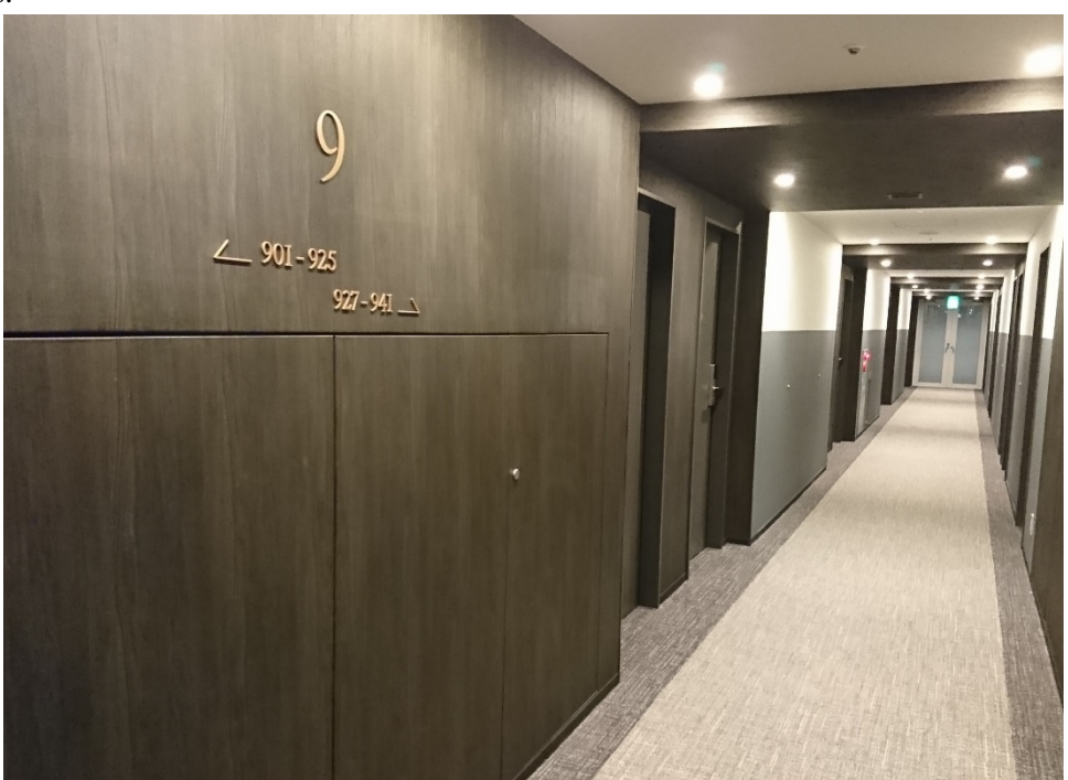
Guest room corridor

The guest room corridors feature a stylish design based on a greyish-blue color scheme evoking images of Italian stone buildings and stone pavements. The guest room signs employ a Centaur font, which has a sophisticated design quality. Through these elements, the hotel has created elegant and refined guest room corridor spaces.