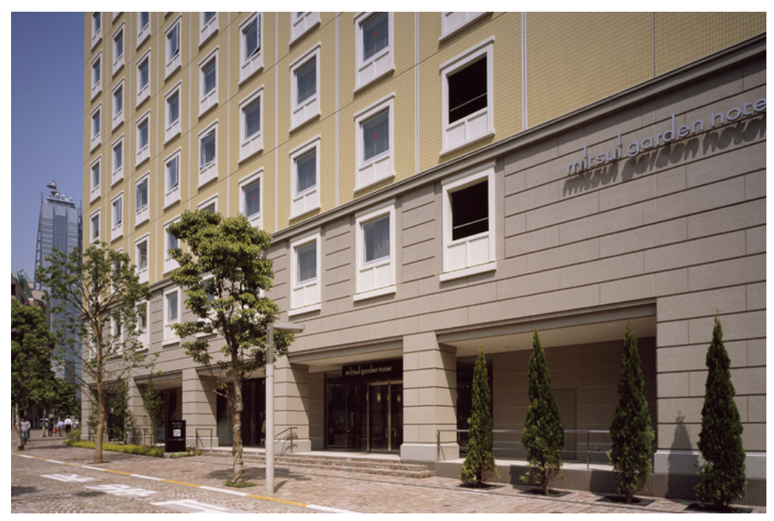
Mitsui Garden Hotel Shiodome Italia-gai