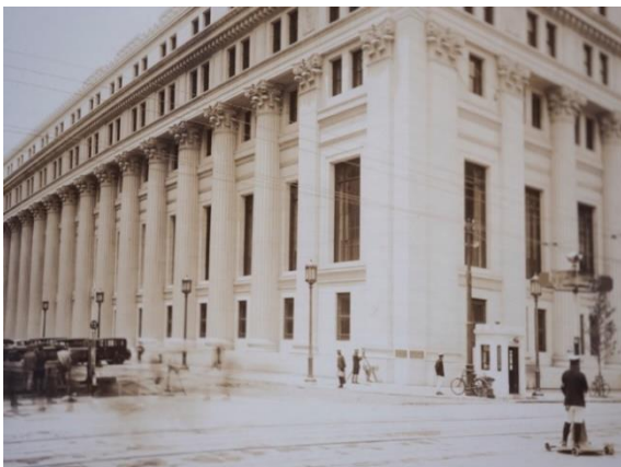
Mitsui Main Building when it first opened