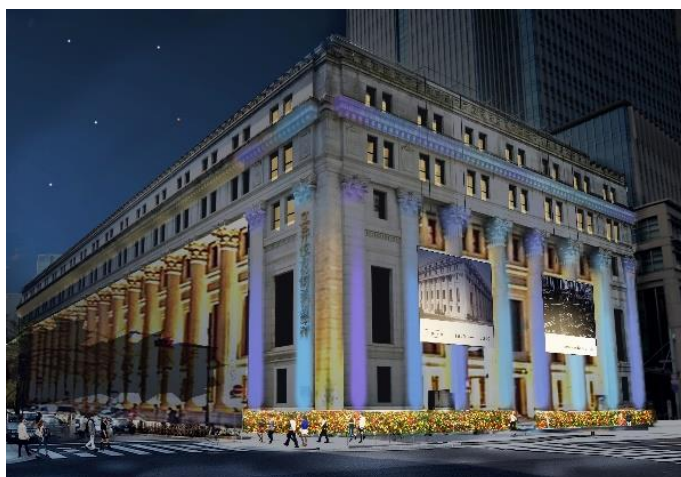
Rendering of Mitsui Main Building exterior