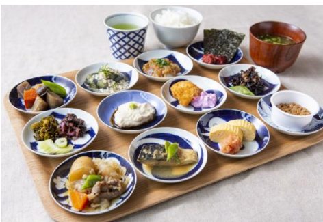
Breakfast menu example