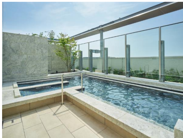
Men's open-air bath

<Operating hours> 3:00 PM to 1:00 AM, 6:00 AM to 9:00 AM *For overnight guests only