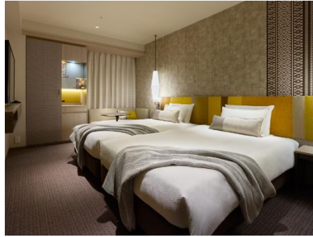
Guestroom (Moderate twin)