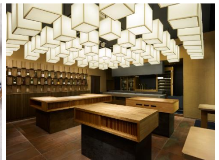
Hakata #092 restaurant