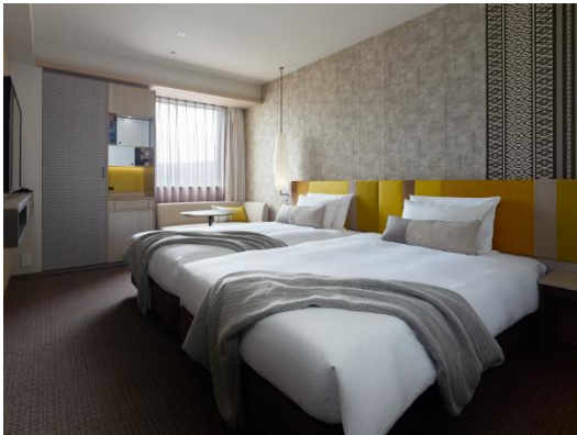
Guestroom (moderate twin)

In addition, two rooms for distinctive executive twin are available. These spacious guestrooms have display boxes filled with traditional craftwork and artwork depicting landscapes of the town to pique curiosity, and serves as a luxurious hideaway for adults.