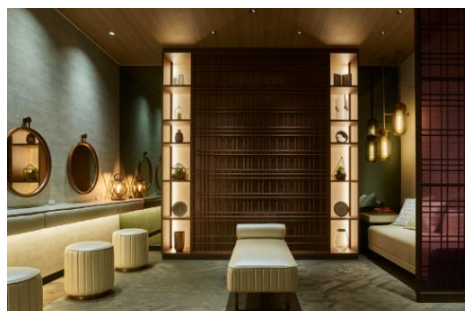
Women's powder room