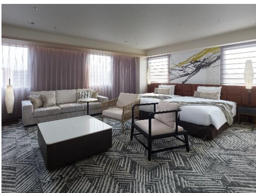
Guestroom (executive twin)