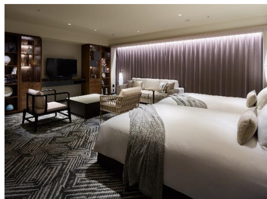
Guestroom (executive twin)