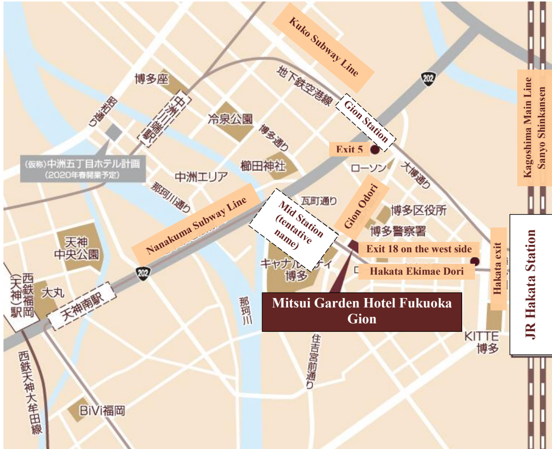
Nanakuma Subway Line Mid Station (tentative name) scheduled to open in 2022