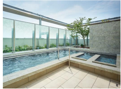
Bathhouse (Women's open-air bath)