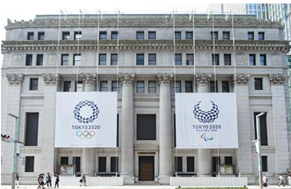
Wall decorations along the Mitsui Main Building on Chuo Dori Street