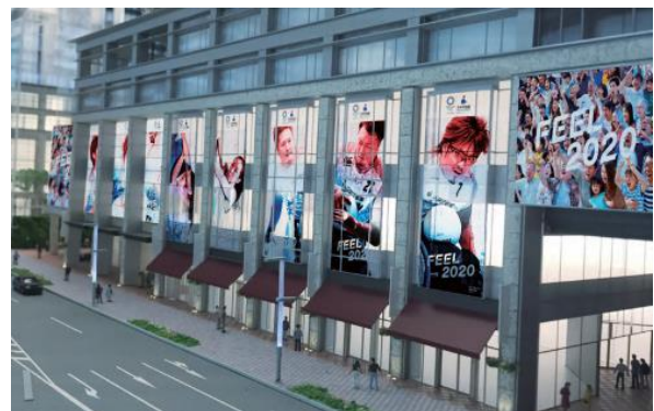
Glass decorations in COREDO Muromachi Terrace along Chuo Dori Street