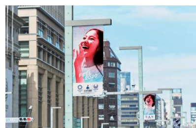
Street flags on Chuo Dori Street