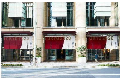
Curtains hung in front of Nihonbashi Mitsui Tower along Chuo Dori Street

In addition, the “Futsujanai 2020 Exhibition” will be held in the Nihonbashi area from Tuesday, July 23 to Sunday, August 4, 2019, and drive momentum for the Tokyo 2020 Games. This is a hands-on event to have fun and enjoy learning about the Olympic and Paralympic sports, events and athletes of the Tokyo 2020 Games.