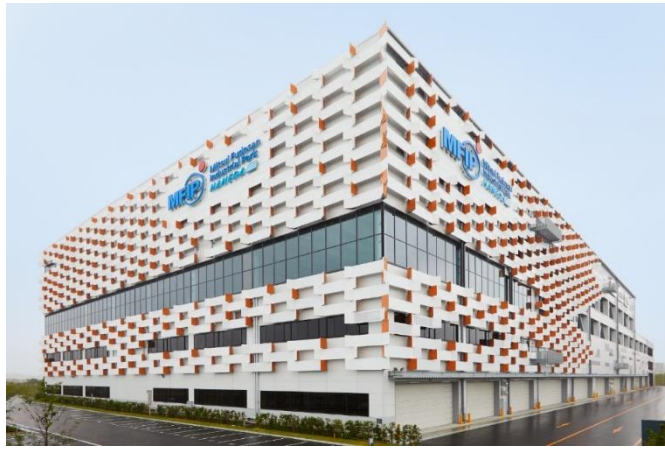
Mitsui Fudosan Industrial Park Haneda (exterior photo)