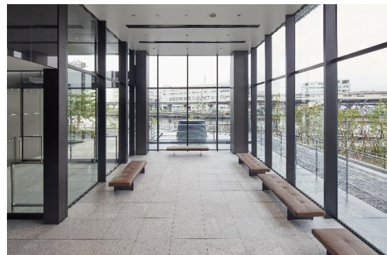
1F Entrance lobby