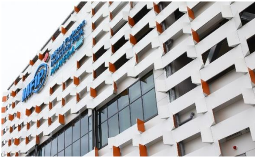
A façade inspired by patterns used in Japanese weaving