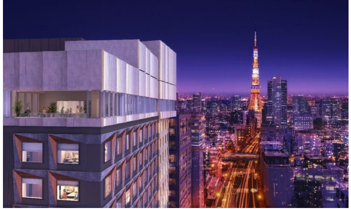
Perspective view from the hotel when completed