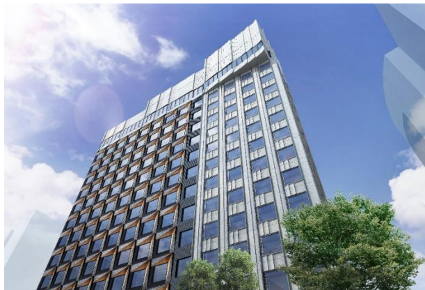
A view looking up at the hotel

The exterior, with a parquet and a Japanese motif using origami and folding screens covered in deep shade, is designed to give inbound tourists a sense of Japanese design, with an outward appearance that changes depending on the time or season, and brings color to the streets of Roppongi.