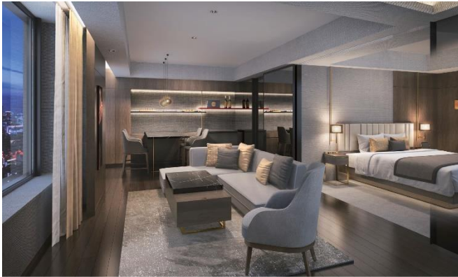
Junior suite (645 ft 2 (approx. 60 m 2 ))

A fitness gym with the latest equipment will also be installed inside the hotel for overnight guests only, inviting them to spend their stay in higher quality.