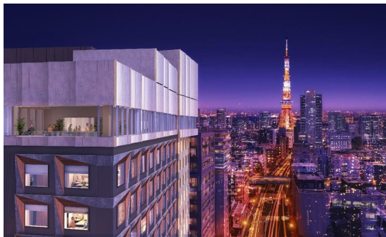
View from the restaurant floor

On the 14th floor, the highest floor of the hotel, there will be a restaurant where guests can view nightscapes of Tokyo, including Tokyo Tower and Roppongi Hills. In the morning, the restaurant will offer a semi-buffet-style breakfast in a comfortable space flooded with natural light. At dinner time, the restaurant will act as a bar where guests can relax while enjoying the nightscape.