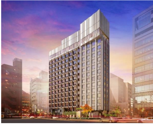
Perspective image of the hotel when completed