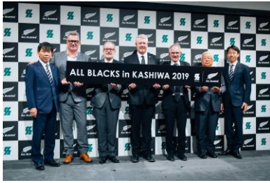
May 31, 2018 Report on decision to hold the pretraining camp