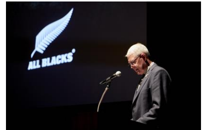
November 2, 2018 Business seminar