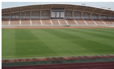
Sports stadium in Kashiwanoha