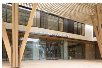
Mitsui Garden Hotel Kashiwa-