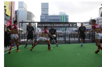
Kashiwa Rugby Day, held in the Kashiwa Station area on October 20, 2018