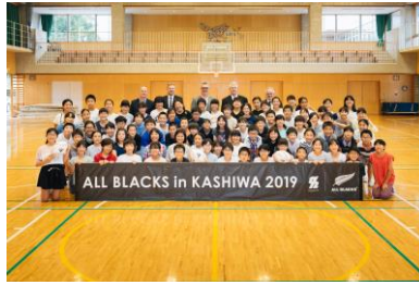
May 31, 2018 Visit to Kashiwanoha Elementary School