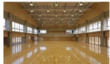
Kashiwanoha Elementary School Gymnasium