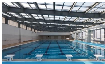
Kashiwanoha Elementary School Swimming pool