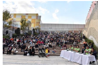
Public viewing space for a 2018 match