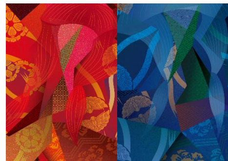
Interior art featuring a motif inspired by the Renjishi (“Two Lions”) Kabuki dance

The hotel location is four minutes on foot from Ginza Station on the Tokyo Metro subway line and one minute on foot from Higashi Ginza Station on the Tokyo Metro and Toei subway lines. Close to the Kabukiza and Shinbashi Enbujo Theatres within Japan’s iconic Ginza commercial district, the location provides a taste of everyday life in modern Tokyo and traditional Japanese culture. Amid a surge in inbound tourism demand, overseas visitors can fully enjoy shopping as well as viewing traditional arts and catching a glimpse of daily Tokyo life.