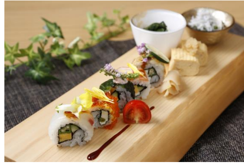
SHARI rolled sushi (Image)