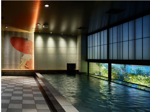
Large Public Bath (for women)

<Opening hours> 06:00–09:00 / 15:00–01:00 *For staying guests only