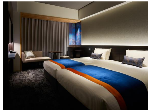
Guestroom with navy blue Renjishi kabuki dance design (Moderate Twin)