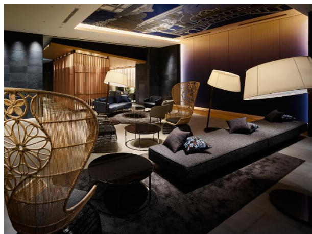
Main lounge (cypress stage)