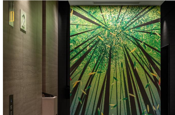
Second floor elevator hall