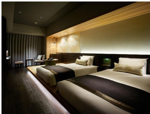
Guestrooms that incorporate Japanese style with an elevated seating area (Deluxe Twin)

In addition, the carpet in the corridors leading the guests to their rooms and in the elevator halls is patterned with brush strokes seen in calligraphy, a well-known traditional Japanese art form, while the corridor walls feature crimson, which has been used in cosmetics since ancient times. The elevator hall walls are hung with Japanese washi paper decorated with falling cherry blossoms that has been carefully made by artisans. These features impart a sense of emotion and activity to the space.