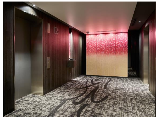
Corridors and elevator halls that use traditional cultural