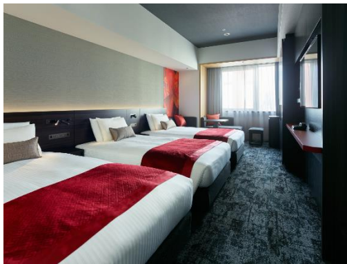
Guestroom with vermillion Renjishi kabuki dance design (Triple)