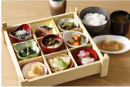
SHARI Japanese food (Image)