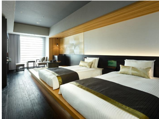
Guestroom (Deluxe Twin)